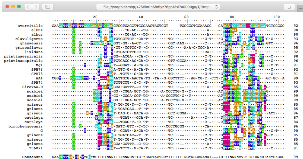
Figure 2: Amplicon with the target site for each primer colored

> names(amplicon) <- desc > # only show unique sequences > u_amplicon <- unique(amplicon) > names(u_amplicon) <- names(amplicon)[match(u_amplicon, amplicon)] > amplicon <- u_amplicon > # move the target group to the top > w <- which(names(amplicon)=="avermitilis") > amplicon <- c(amplicon[w], amplicon[-w])