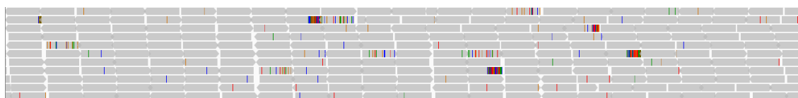
Figure 3: Simulated reads mapped in proper pair. Mismatches and soft-clips are shown as colored vertical lines in reads.